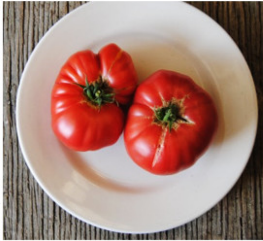
Tomato 'Brandy Boy'

greenhouse, ready for Memorial Day planting. Here are my selections for this year. In the large red tomato category my favorite is 'Brandy Boy' so I'll put in several of those. It has fantastic flavor and it bears heavily. If I could grow only one tomato, this meaty tomato would be it. Next is 'Wisconsin 55', an older hybrid, created just after WWII. It is smaller than 'Brandy Boy,' but has a zestier flavor and is a consistent performer. 'Rose' is a pink beefsteak type, with a smooth, yet full flavor. 'Ficarazzi' is new, said to be highly acidic, which is the reason for its strong flavor (so they say). Lastly, and slightly smaller, is the French 'Carmello.' This ten ounce tomato (a little smaller than a tennis ball) is very popular among home gardeners in Europe. It is flavorful, very productive, and crack resistant, despite its thin