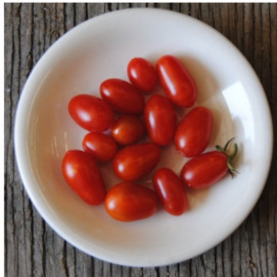
Tomato 'Cherry Roma'

I know I recommend that you wait to plant the tropical vegetables, but you can't wait, can you? I don't blame you---we all have Spring Fever. If I didn't have a greenhouse, I'd buy my plants and take them indoors and out, depending on the weather, until planting time. I might even transplant some of them to a larger pot size, especially the fast growers like tomatoes. They would definitely benefit from that. If you decide to go ahead and plant directly in the garden, may the warmth be with you. Happy planting!