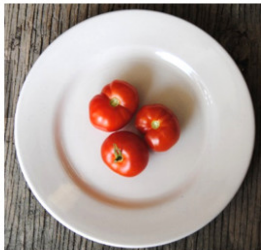
Tomato 'Bloody Butcher'

In the salad tomato category (about 2" wide) my perennial favorite is 'Bloody Butcher.' The meat of this tomato is the deepest red of any tomato I've seen. It is very flavorful, and is one of the earliest of all tomatoes. I've never counted, but I bet a well grown plant produces well over 75 tomatoes. I'm trying two new salad tomatoes this year---'Plum Crimson' and 'Slava Plum.' Both are reputed to be very flavorful and productive. Incidentally, when evaluating new tomatoes, I try to give them all numerous taste tests. I've found that the flavor can vary with the fluctuating environmental factors, so I like to taste them several