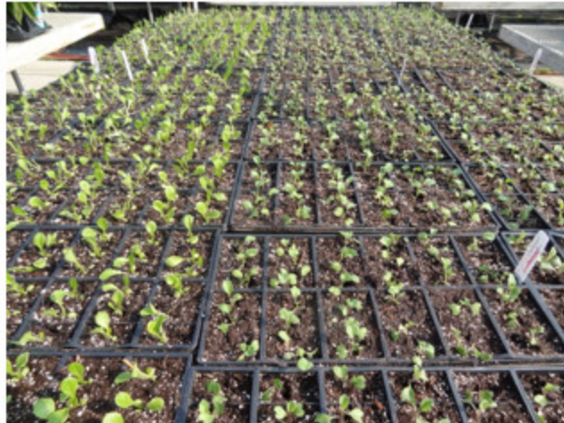
Freshly planted crop of "Greens"

In my garden, various spring crops have already finished----radishes, lettuce, spinach, kale, peas, mustard greens, and more. I have removed those plants so the soil is ready for other crops, crops that do well in late summer and autumn. In the time between crops, I added some compost to fortify the soil so it will be perfect for fall planting.