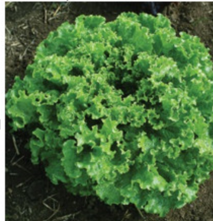
Lettuce Green Star

cauliflower, Swiss chard, and mizuna. But