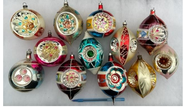
Large Indents 2