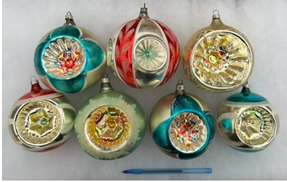
Large Indents 1